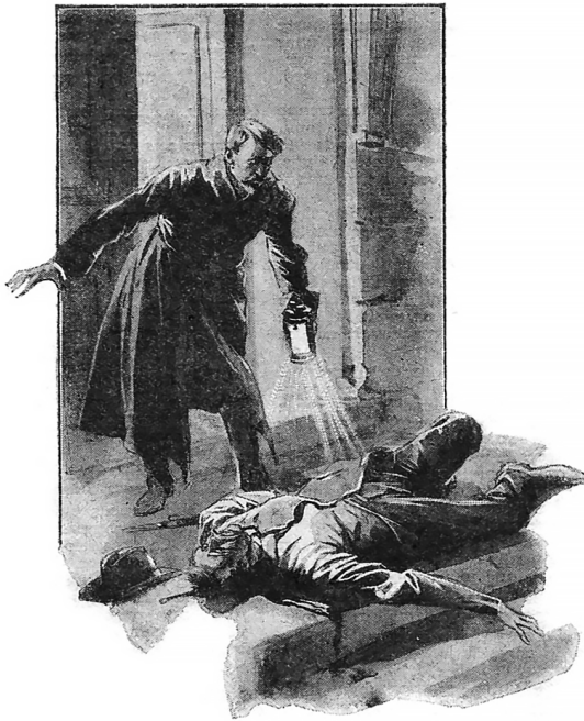
Je me hâtai d'aller chercher une lumière et je trouai un malheureux...

"I WENT BACK FOR A LIGHT, AND THERE HE WAS, THE POOR FELLOW."